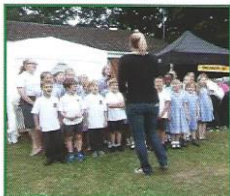
We are the children of Bisley School!