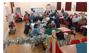
Congrats & thanks to the Teas on the Rec team for their winter fundraiser at the Village Hall!