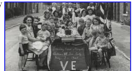
VE Day Street Party at the Rifles Clubhouse in Bisley

In the United Kingdom more than one million people took to the streets to celebrate peace, to mourn the loss of their loved ones and to mark the end of the European part of the war. Whilst in London crowds massed at Trafalgar Square and up the Mall to Buckingham Palace, to see King George, Queen Elizabeth and Prime Minister Winston Churchill, Bisley residents were also celebrating.