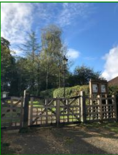
New Bisley Church Gates